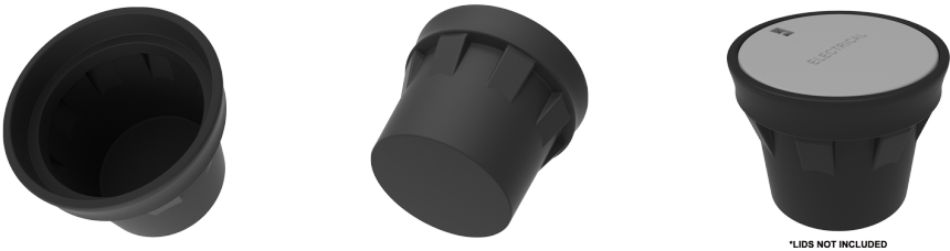
*LIDS NOT INCLUDED

Our MONObox™ plastic pit range is manufactured from up to 90% recycled materials ensuring that your pit solution is sustainable and environmentally considerate.