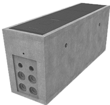
*COVERS NOT INCLUDED

Various key industry authorities have approved our precast concrete cable pit range for specific project requirements across various sectors.